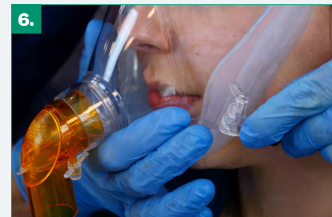
6. Clip the headstrap into place.