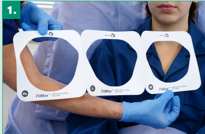
1. Select the correct size using the size guides that are supplied in the outer box.