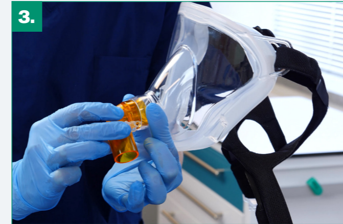
3. Attach the elbow to the swivel connector and check its smooth rotation.