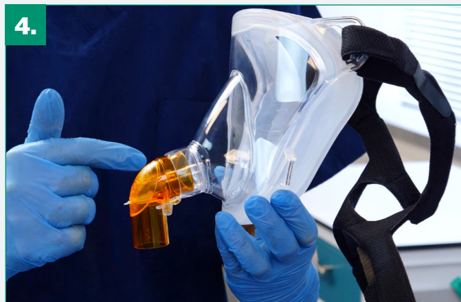
4. If the orange elbow is used - Check the vent holes on the elbow and ensure that the anti-asphyxiation valve assembly is present and undamaged.