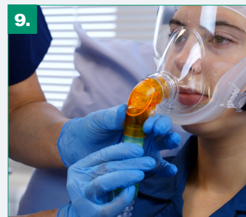
9. Start the gas flow and attach the breathing system using a push and twist action. Make final adjustments while the patient lies down.