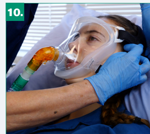
10. Ensure that the headgear is not overtightened. Straps should be adjusted to minimise contact pressure while ensuring a good seal.